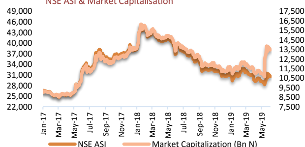
NSE ASI & Market Capitalisation

The Local Bourse closed on a bearish note today having lost 36bps. The Exchange also recorded 20 losers and 15 gainers while the year to date loss of the NSE ASI worsened to 3.53% from 3.18%. Shares of UNITYBNK, DANGFLOUR, OANDO dropped by 10%, 2.44% and 3.75% respectively, dragging the NSE Banking, NSE Consumer goods and NSE Oil and Gas indices lower by 0.10%, 0.62% and 0.21% respectively. The total value of equities traded fell, by 10.75% to N3.4billion as did the total volume which fell by 19.04% to 247.40 million units. Meanwhile, NIFTY fell across maturities tracked amid renewed buy pressure activity; also, NIBOR which dipped for most maturities tracked on renewed liquidity ease. In the bonds market, the values of OTC FGN papers rose for most maturities tracked; Likewise, the FGN Eurobond prices rose for across maturities tracked in the international Market amid sustained bargain hunting activity.